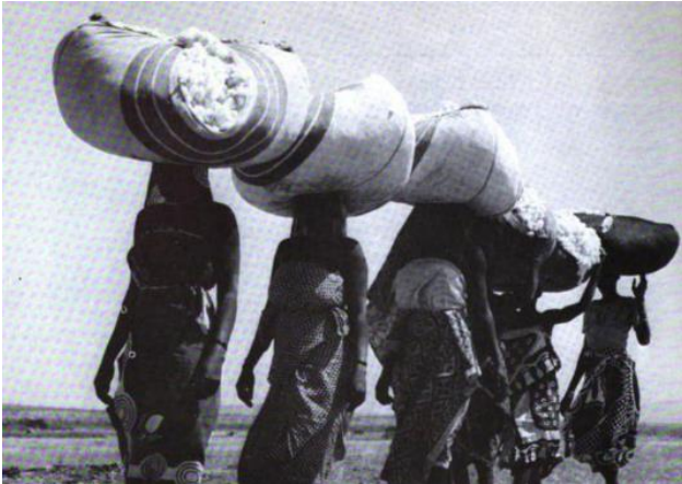
Figure 2: Women carrying cotton loads to a buying post

Source: Carey Bryan Singleton, The Agricultural Economy of Tanganyika , (Washington, D.C.: Foreign Regional Analysis Division, Economic Research Service, U.S. Dept. of Agriculture, 1964) p.24