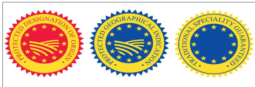
Figure 1: Geographical Indication Labels. (From left): PDO (Protected Designation of Origin); PGI (Protected Geographical Indication); and Traditional Speciality Guaranteed (TSG)

Awareness of the official EU logos is very low among consumers in Tanzania. The respondents were asked if they could link known product quality with geographical characteristics as an alternative expression to GI definition. Approximately 62% of the respondents were 'aware' of the quality attributes of the products, and could provide such a link. However, when shown the GI EU labels and asked if they ever had a knowledge of such labelling, only 38% (N = 49) of the consumers said 'Yes'; and explained they had seen such labels from the Internet or television advertisements. They linked the GI label to organic labels, which they explained as an important aspect especially when purchasing products with medicinal properties, such as Aloe vera. This means consumers were aware of the characteristics of the products, and could link them with areas of production. However, it was a relatively small percentage of participants who were aware of the GI labels (Figure 1). This finding is consistent to Lee et al. (2020) who found that individuals were aware of product characteristic, but associated it less with information provided on product labels.